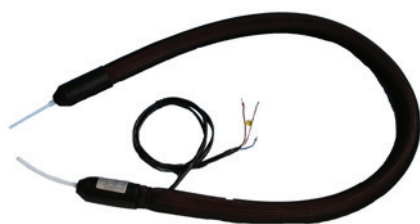
Type 4-N(M) 4/6 C/Y