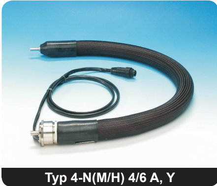
Typ 4-N(M/H) 4/6 A, Y