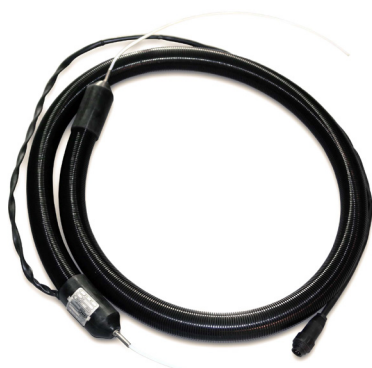
Type M4/6 with A and Y