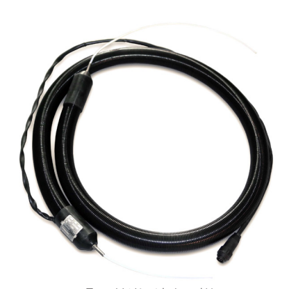
Type M4/6 with A and Y